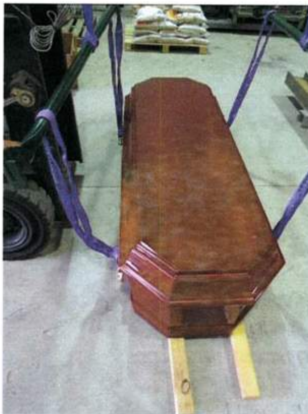
Figure 1: General test configuration.

Test Conclusion: The coffin witheld a load of 400kgf for a period of 5 minutes without evidence of failure, permanent deformation, damage or loss of functionality. This establishes a Working Load Limit of 200kg's with a Safety Factor of 2.